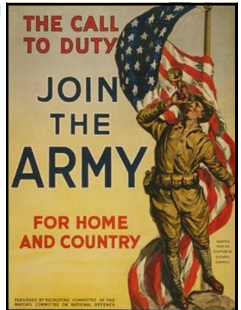
World War I poster