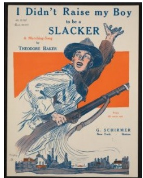
I Didn't Raise my Boy to be a Slacker by Theodore Baker, Song cover